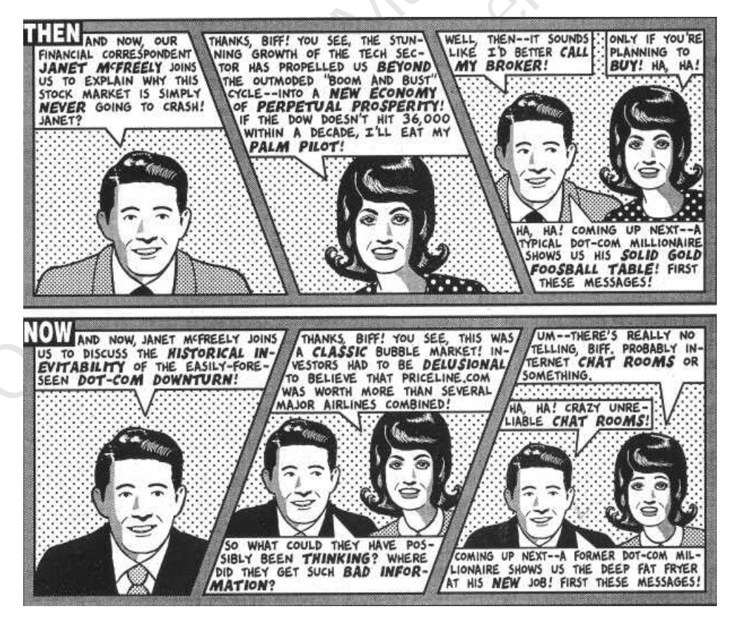
New York Times, March 15, 2001

Nobody was well served by the veneration of the "I know" school in the late 1990s: Main Streeters were lured to invest in Wall Street without an understanding of the skills required or the risks entailed. The market and thus the economy were put through an extreme boom-bust cycle. Risk-taking investment gunslingers were anointed, and cautious value seekers were rendered irrelevant. And the oracles themselves eventually were brought low – they seem much less free with gratuitous wisdom and can't-miss buy recommendations today than they were four years ago.